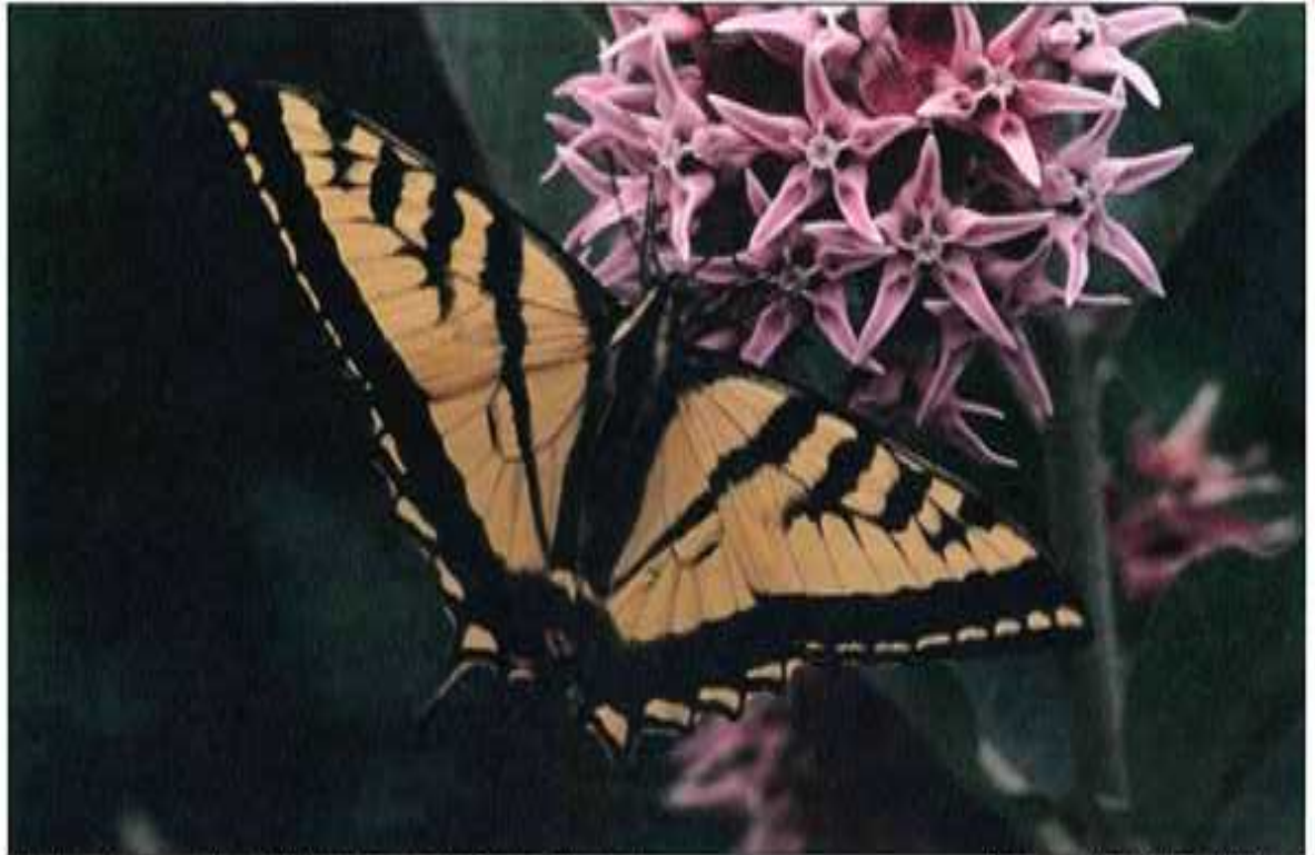
Western tiger swallowtail drinking nectar from milkweed.

Flowers that provide nectar and caterpillar hostplants can be grown in almost any garden, and will help butterflies.