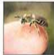
Gentle cellophane bee ( Colletes sp.) nest in the ground—often in lawns!