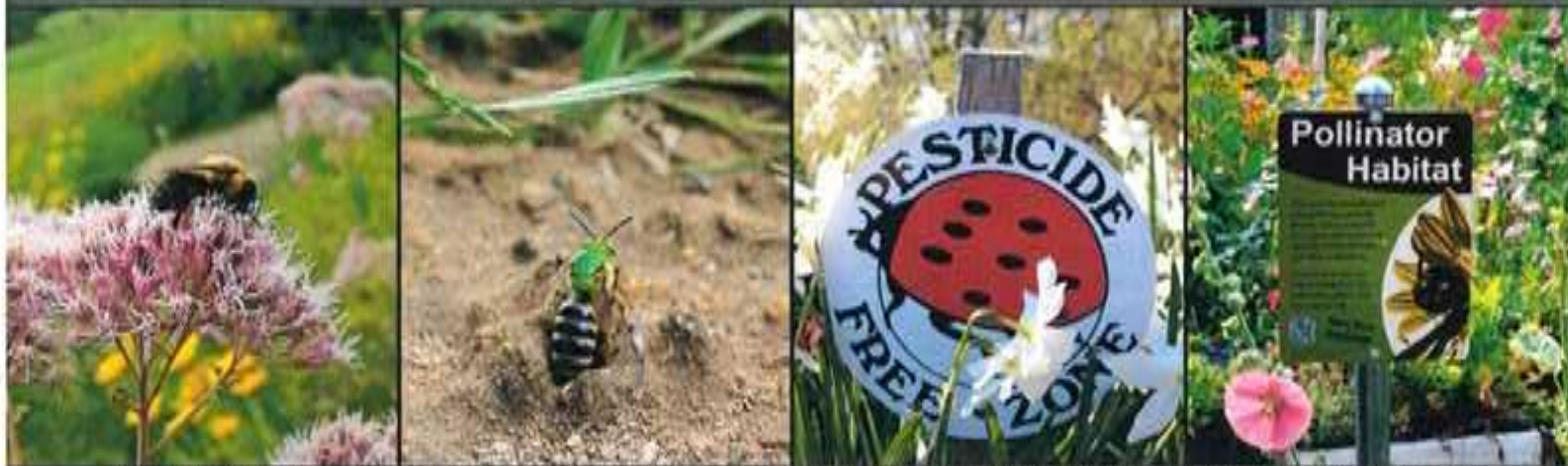
Brown-bellied bumble bee ( Bombus griseocollis ), metallic green sweat bee ( Agapostemon splendens ) exiting ground nest, "Pesticide Free" garden, and pollinator habitat with sign.