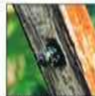
Solitary small carpenter bee ( Ceratina sp.) nesting in blackberry cane.