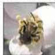
Mining bees ( Andrena sp.) are important pollinators of apples and other crops.